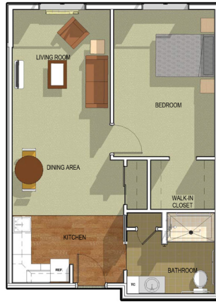
SIX MILE ONE BEDROOM SUITE 539 to 677 Square Feet

These expanded one bedroom suites provide additional living space, including a large bedroom and a spacious living room. All of the units also include a large private bath with walk-in shower. Many units include views of the surround natural area.