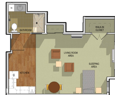
PRAIRIE STUDIO 442 to 563 Square Feet

These expansive studio apartments provide quality living space including a separate living area and sleeping space. All of the units also include a large private bath and walk-in shower. Many units have optional views of the surround natural area.