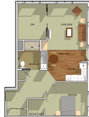
CAPITAL VIEW CORNER SUITE 868 to 878 Square Feet

These expansive one bedroom suites provide the highest of quality living space including a large bedroom with walk-in closet, in-unit kitchenette with dinning area, and a spacious living room. All of the units also include a large private bath, walk-in shower, and additional closet storage. Many units have optional views of the surround natural area.